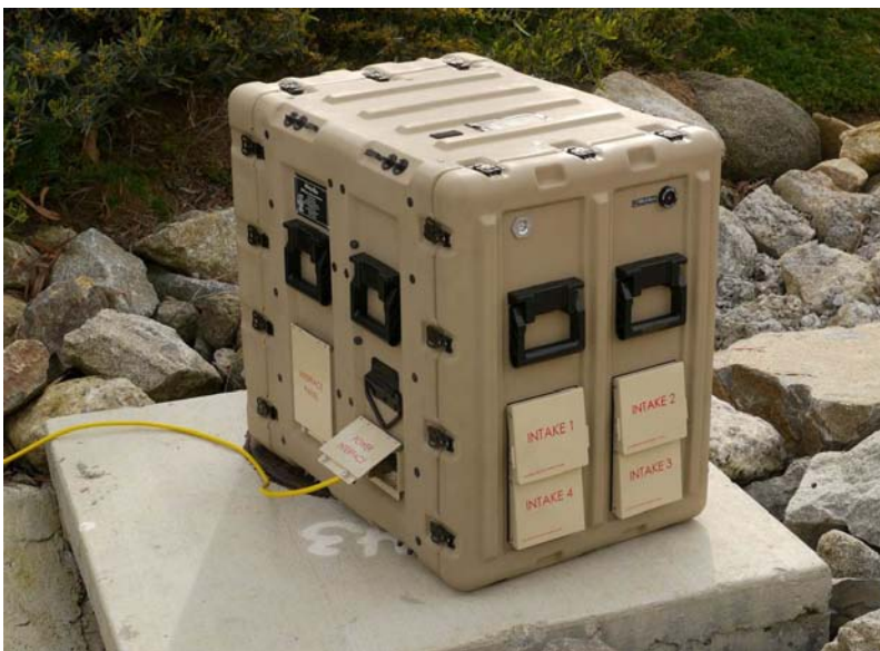
Above: 14U 110/220 VAC and 12 VDC Rhino Box®

Use the Rhino Box® shelter to pre-stage standalone system solutions and rapidly respond to critical deployment requirements anytime, anywhere.